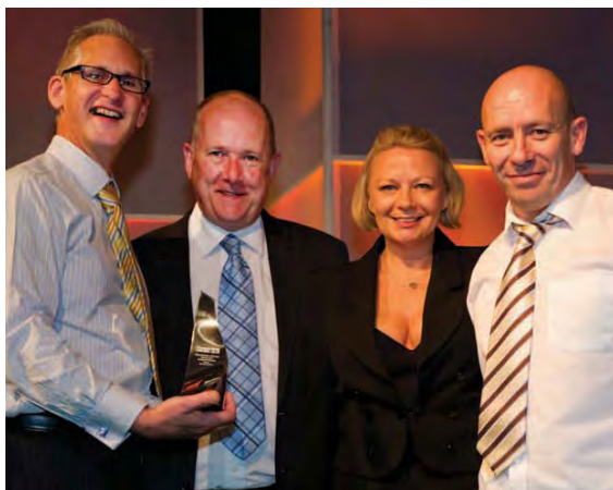
Cartrefi Conwy won the 2010 UK Sustainable Housing Award in partnership with G Purchase Construction and Crest Co-operative