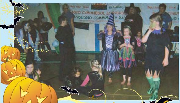
Fun and games at the party; hosted by Cartrefi Conwy and North Wales Housing.

For the second year running over 200 people attended the party at Ty Hapus. Face painting, spooky colouring, a bouncy castle, games and a fancy dress competition provided fun for everyone.