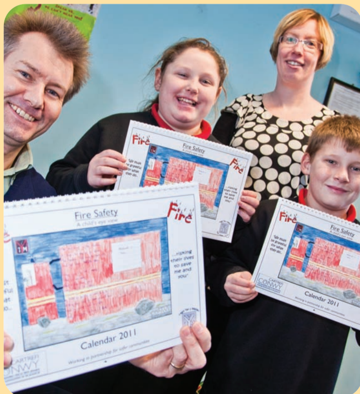
Kids at Tan y Marian school got together with staff at Cartrefi Conwy and produced a calendar to help remind their families about the importance of fire safety.

Smoke alarms that have been fitted in your home should never be removed. If you have checked your fire alarm is working and think it is faulty or find that one may be missing, please call our repairs helpline on: 0800 012 1431